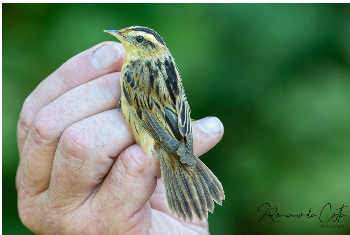
Aquatic Warbler, Jersey 2022.