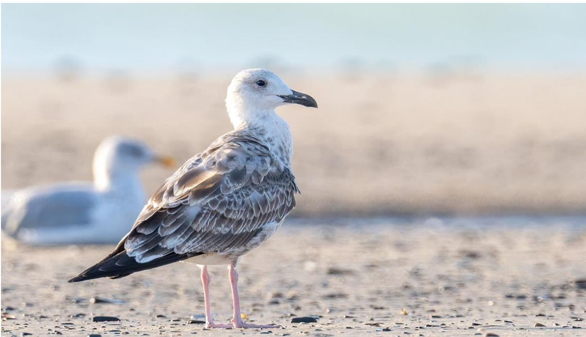
Caspian Gull, Jersey 2022.