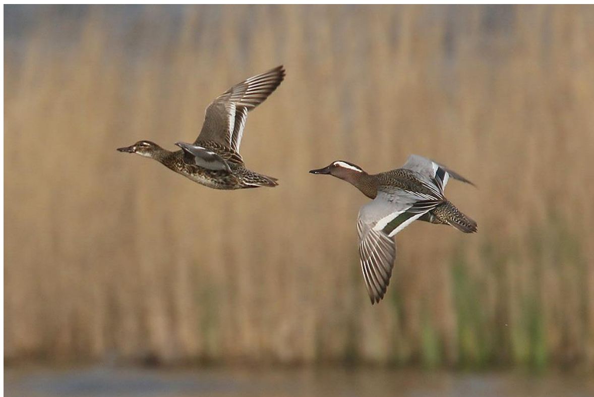
Garganey, Jersey 2017.