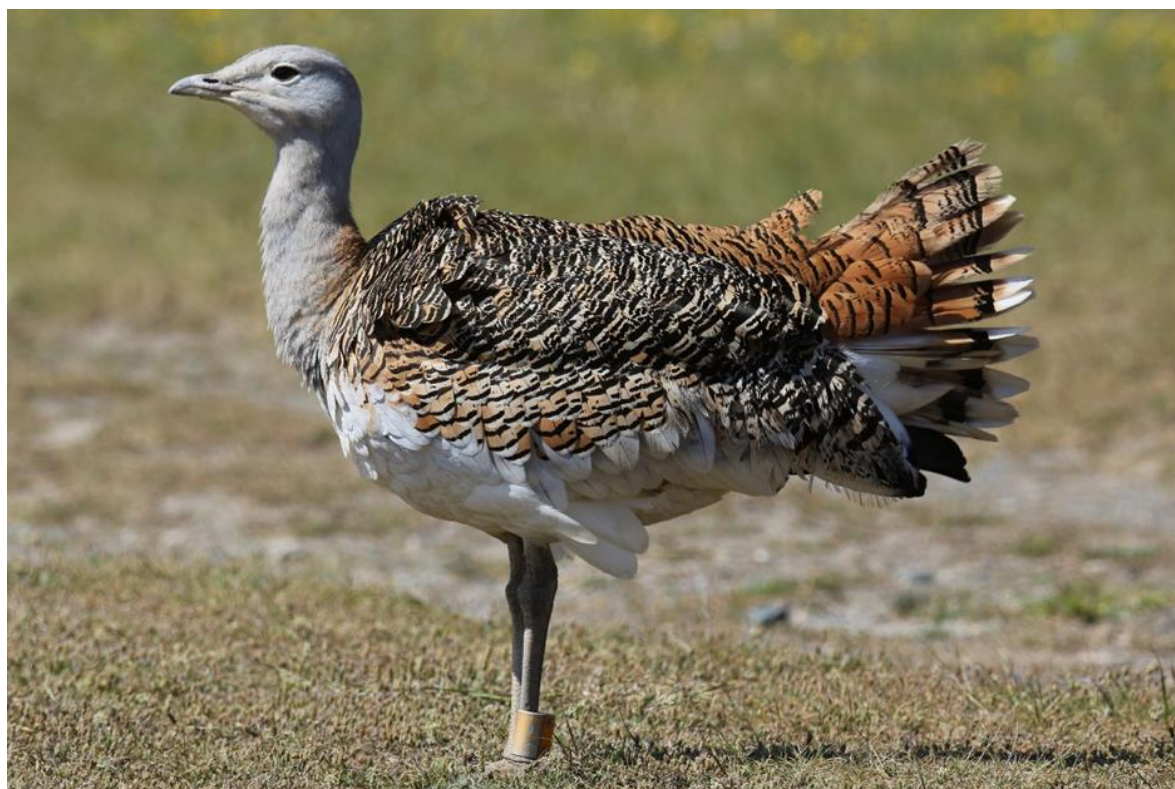
Great Bustard, Alderney 2022.