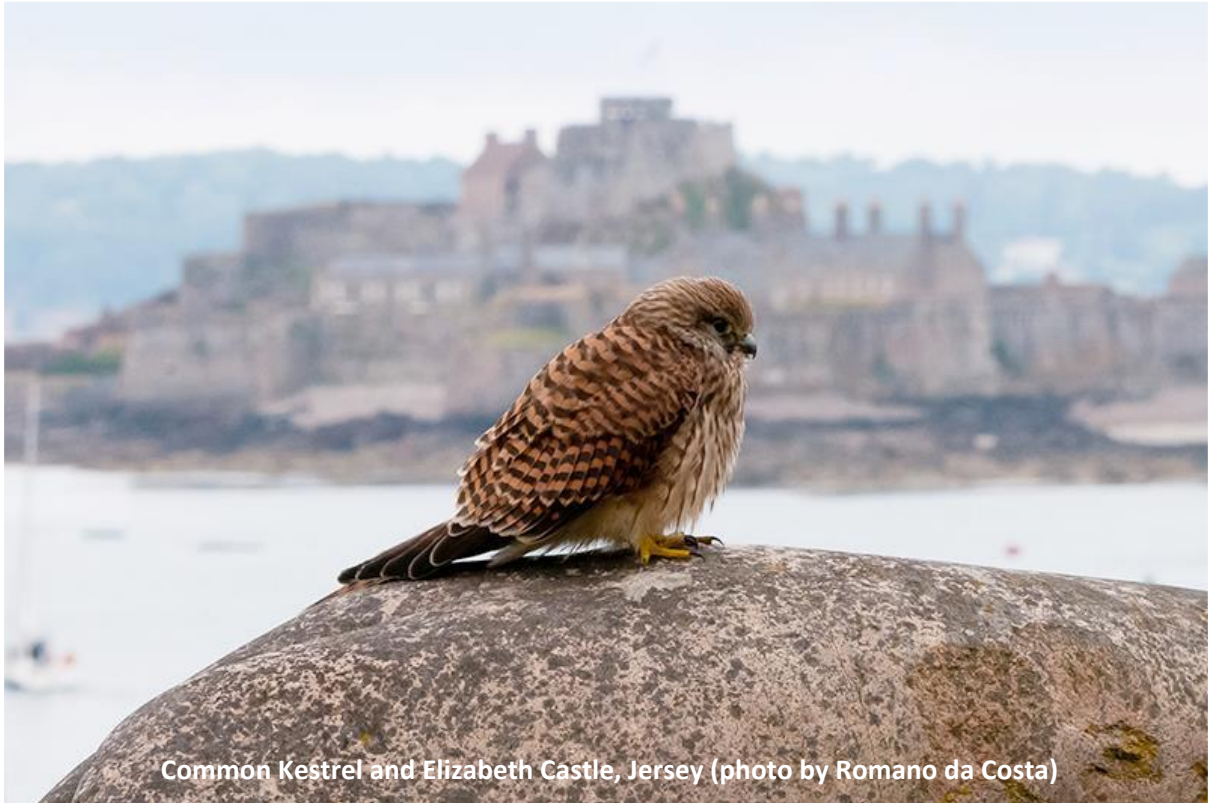
Common Kestrel and Elizabeth Castle, Jersey