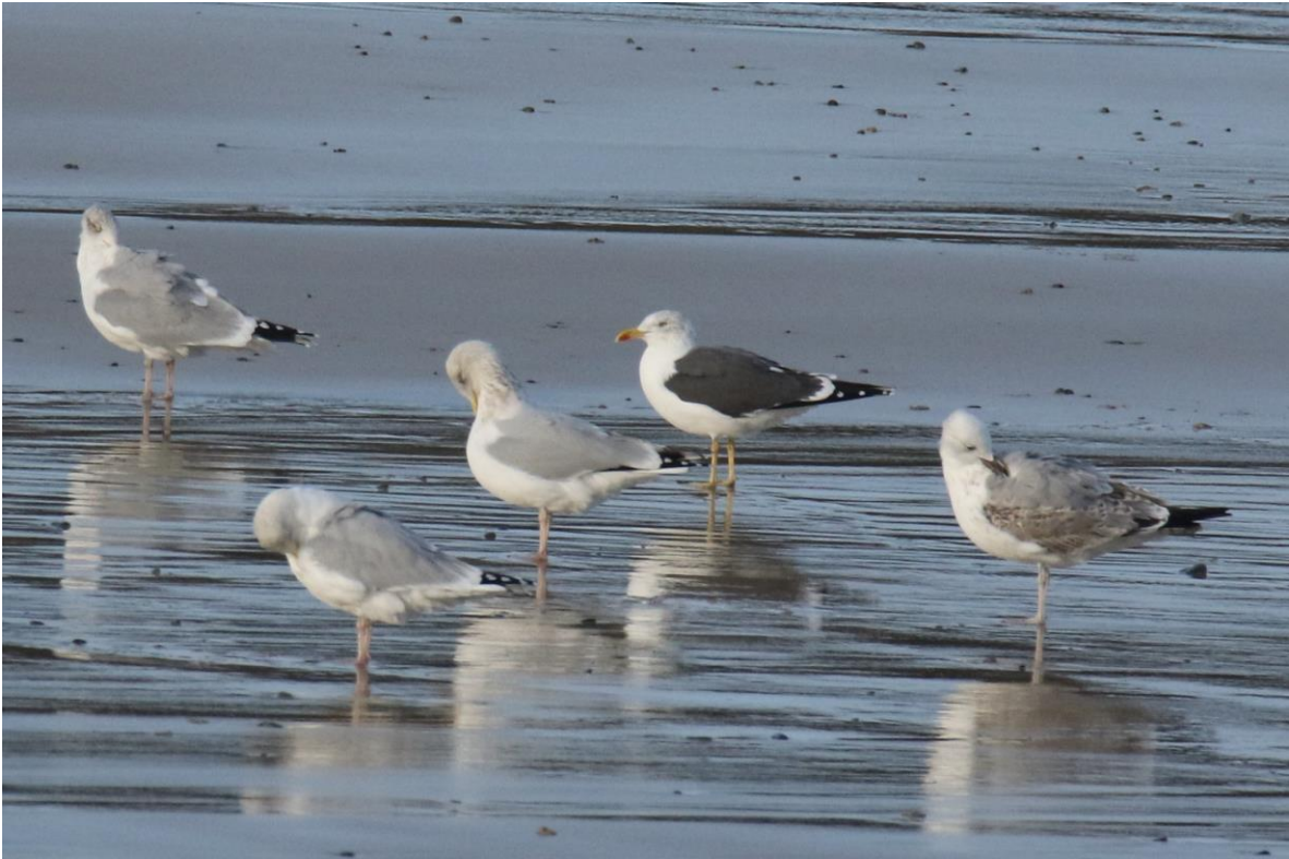
Caspian Gull (far right) with Herring Gull and Lesser Black-backed Gull, Alderney December 2022.