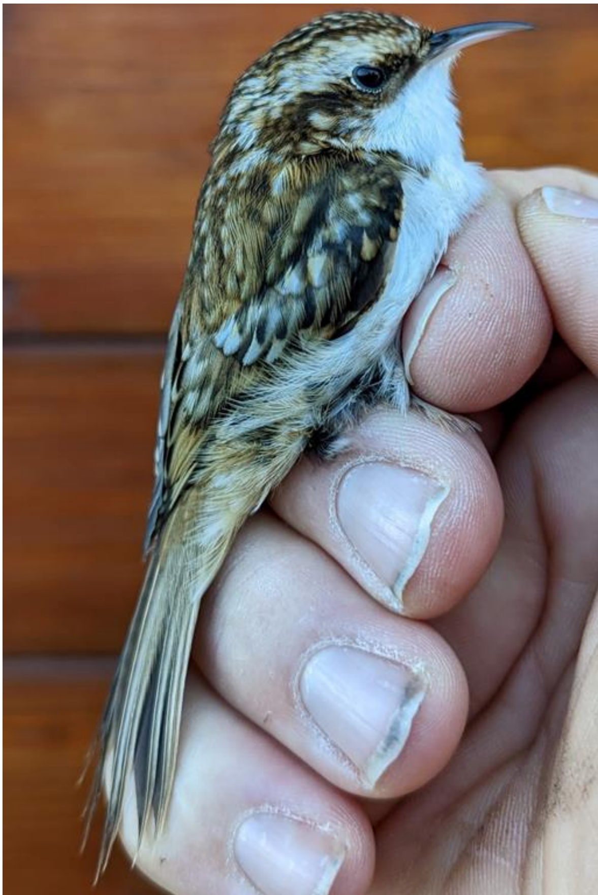
Common Treecreeper, Alderney 2022.