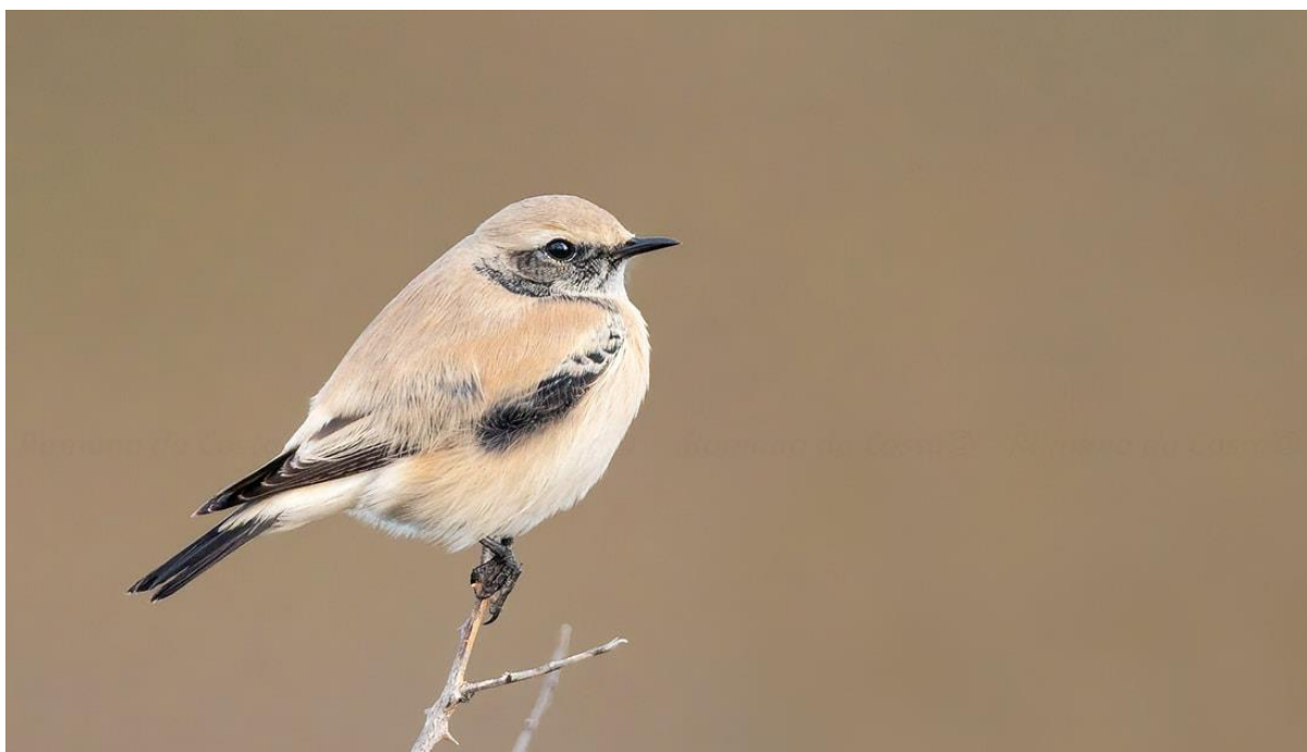
Desert Wheatear, Jersey 2022.