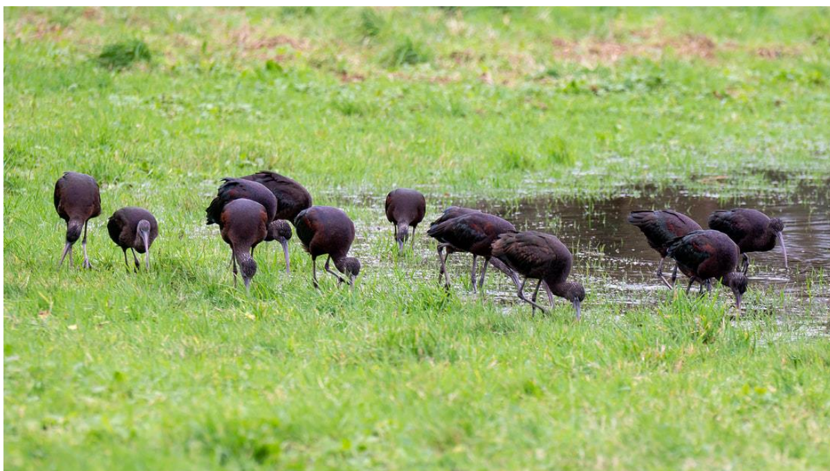
Glossy Ibis, Jersey 2022.