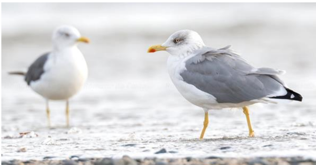
Yellow-legged Gull, Jersey 2022.