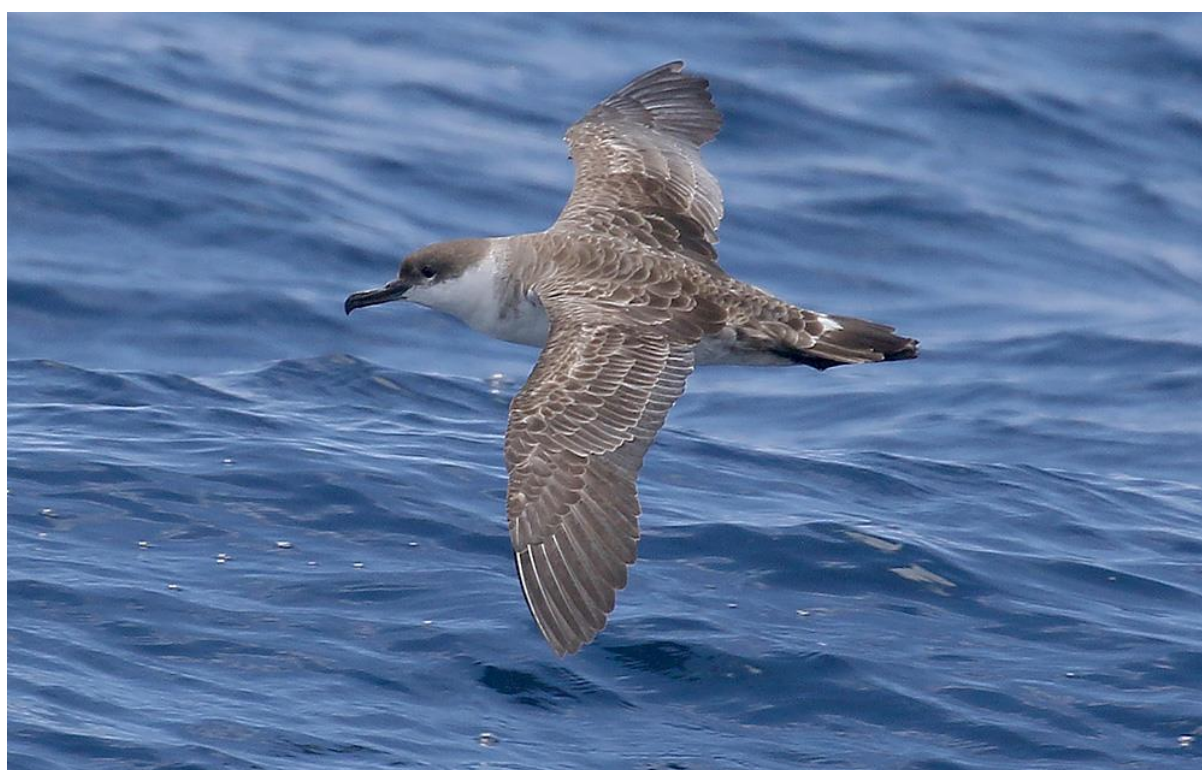
Great Shearwater (not CI).