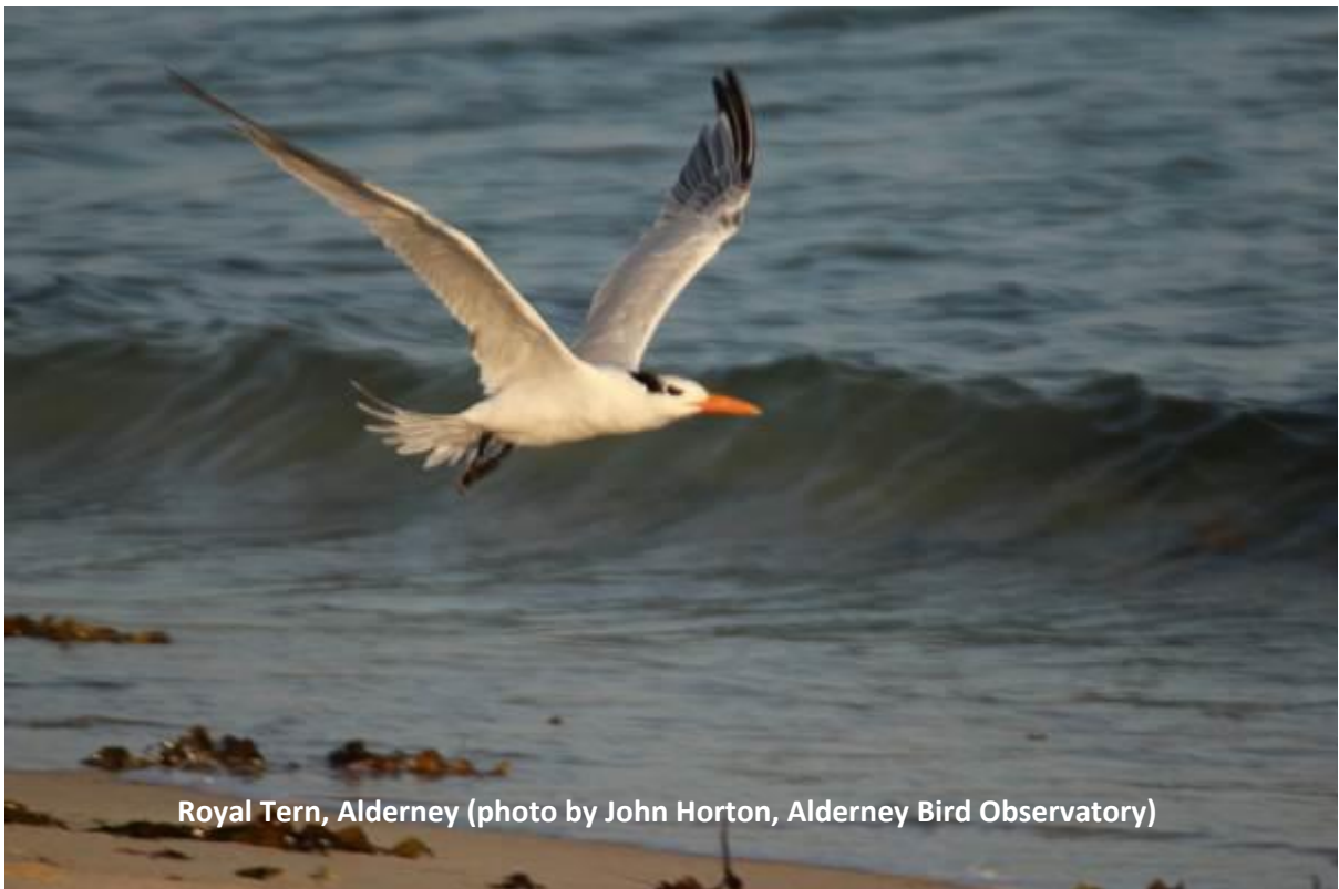
Royal Tern, Alderney