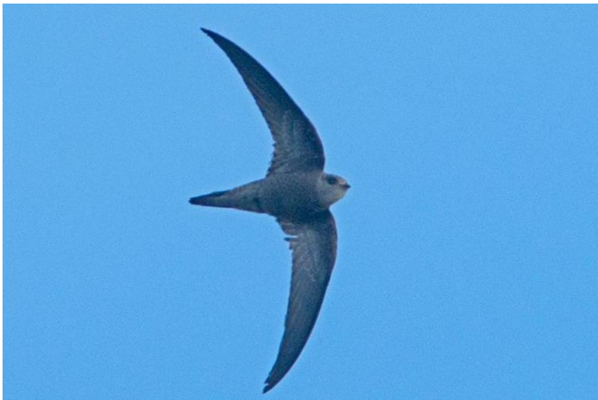
Pallid Swift, Alderney October 2022.