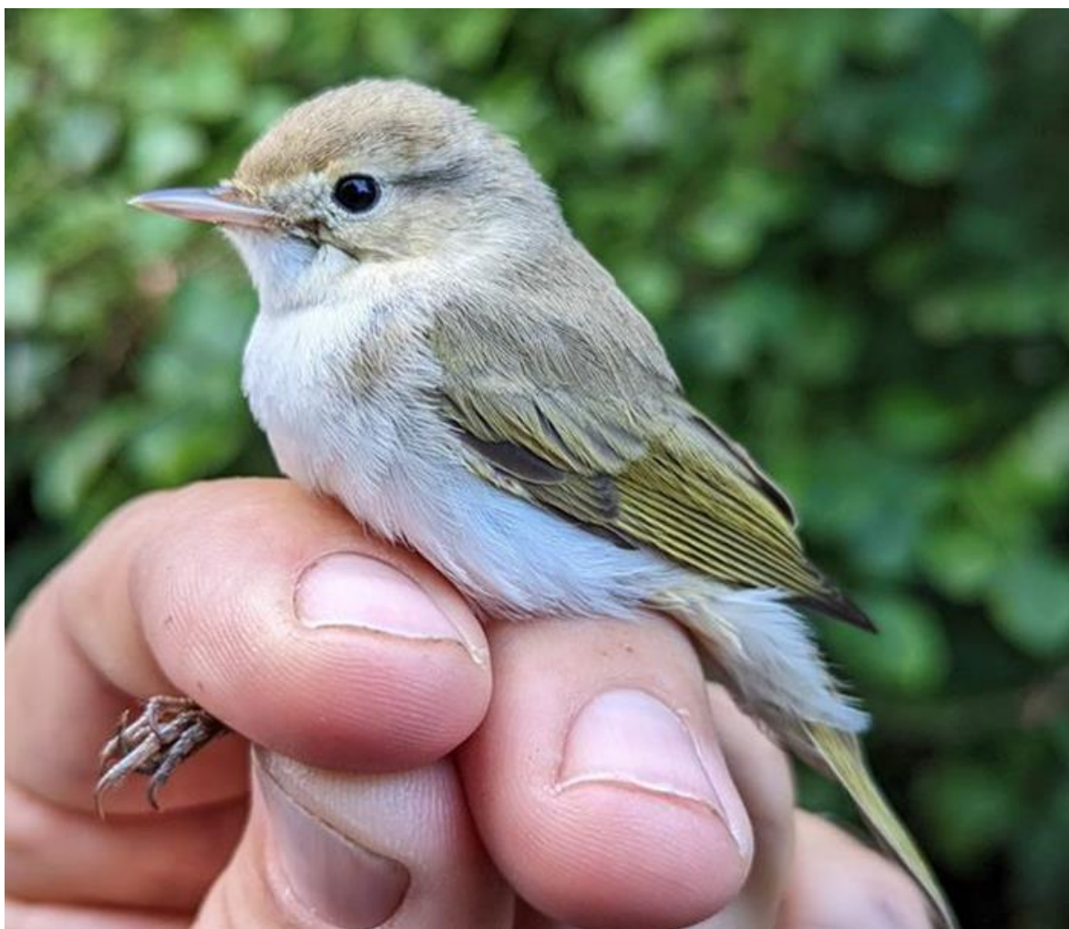
Western Bonelli's Warbler, Alderney 2022.