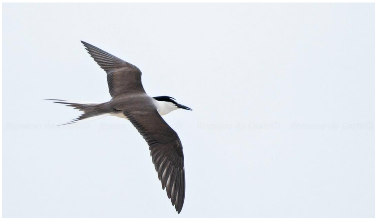
Bridled Tern, Jersey 2022.