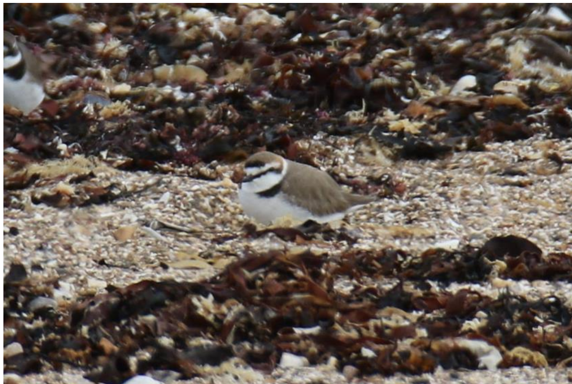
Kentish Plover, Alderney 2022.