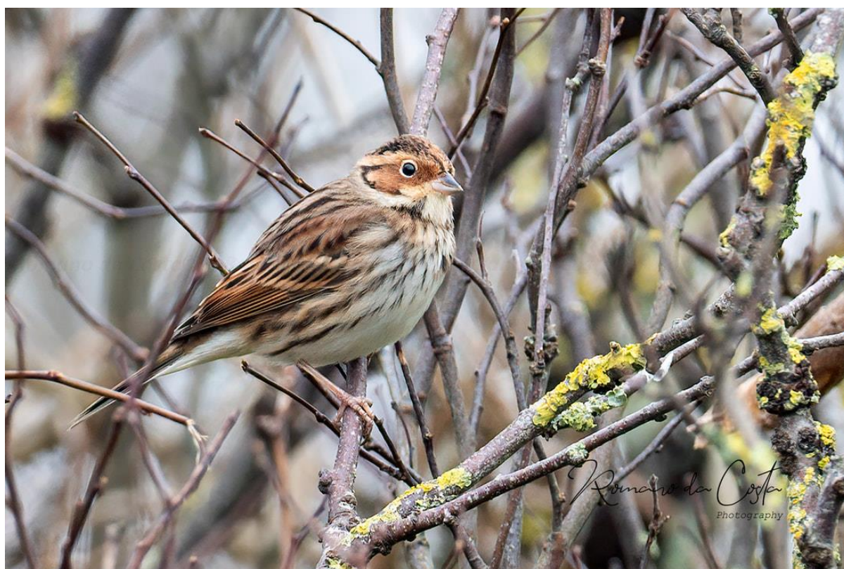
Little Bunting, Jersey 2022.